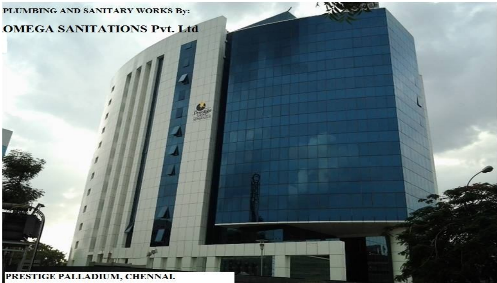
PRESTIGE PALLADIUM, CHENNAI.

PLUMBING AND SANITARY WORKS By: OMEGA SANITATIONS Pvt. Ltd